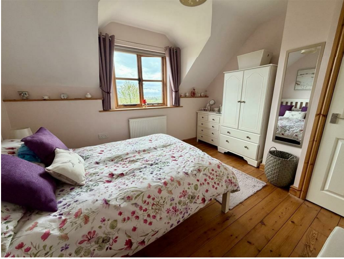
Main Bedroom 11'11" max x 9'11" (3.65 max x 3.04)