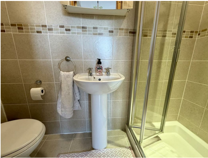
En-Suite Shower Room/WC 7'4" x 2'4" (2.26 x 0.73)