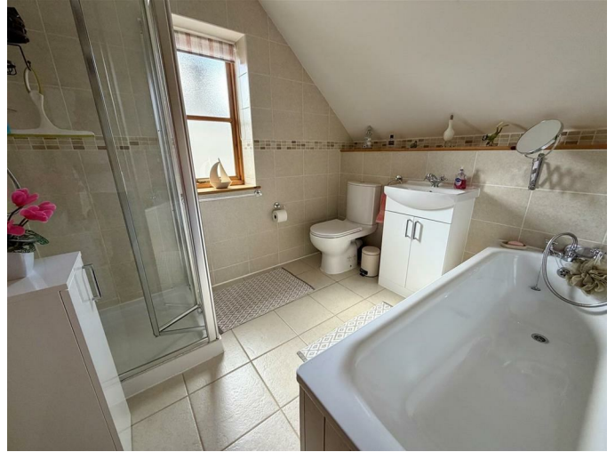
Bathroom/Shower Room/WC 8'1" x 7'4" (2.48 x 2.25)