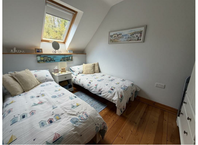
Bedroom 3 10'8" x 7'4" (3.27 x 2.25)